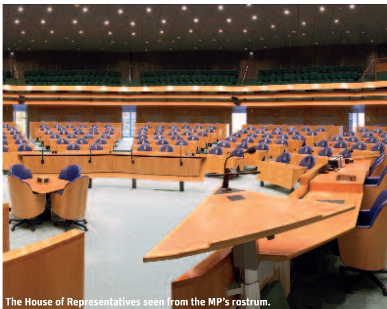
The House of Representatives seen from the MP's rostrum.

of Representatives tends to be a lot fuller, as well as during House votes, which are usually held on Tuesdays.