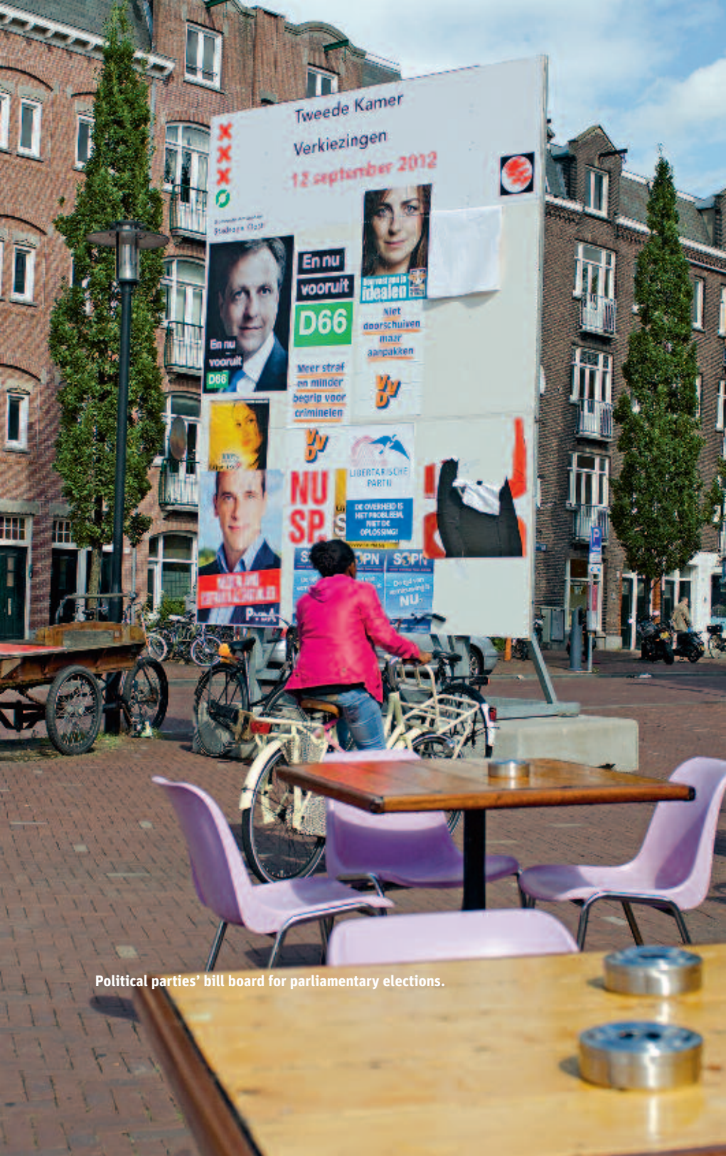
Political parties' bill board for parliamentary elections.