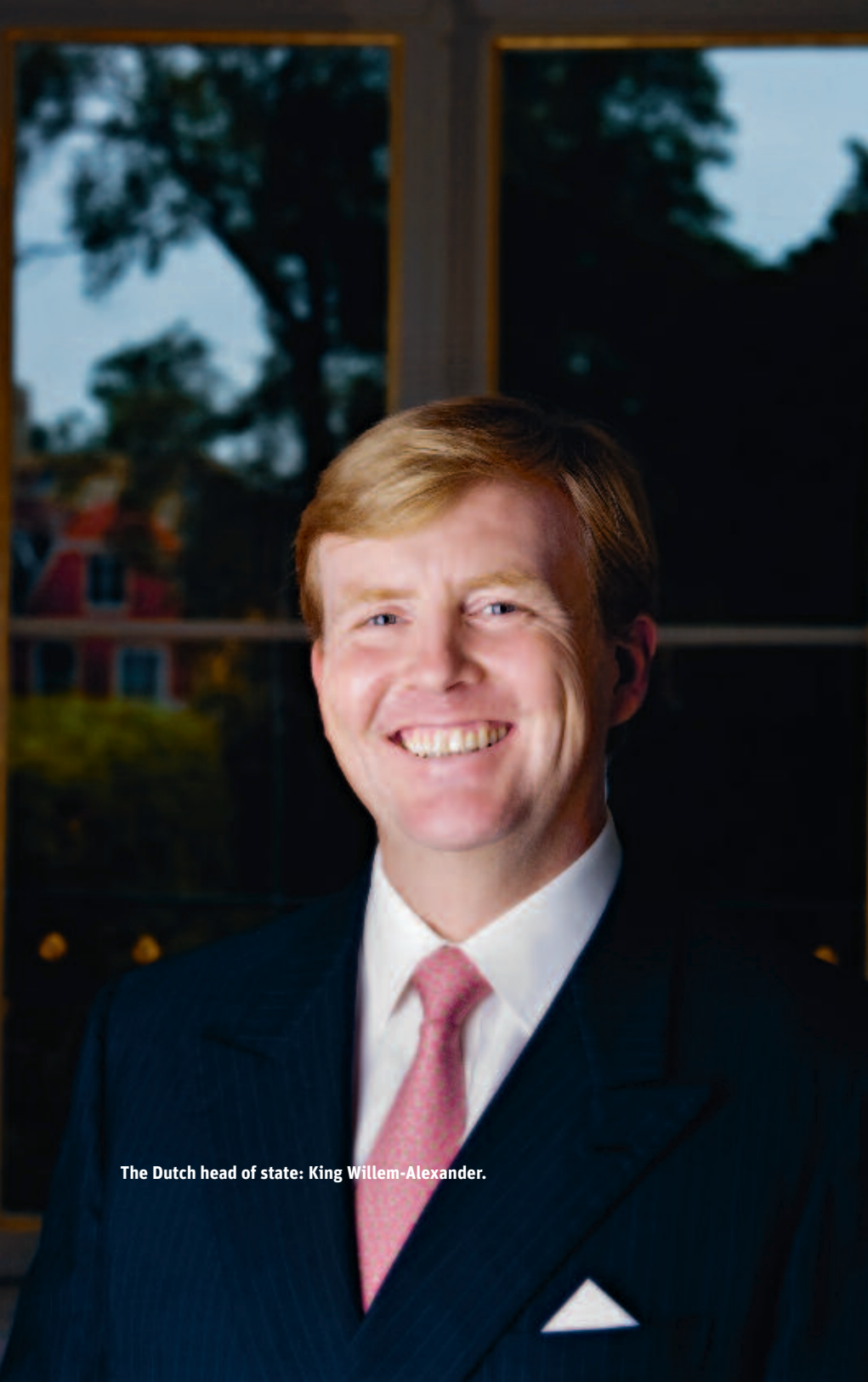
The Dutch head of state: King Willem-Alexander.