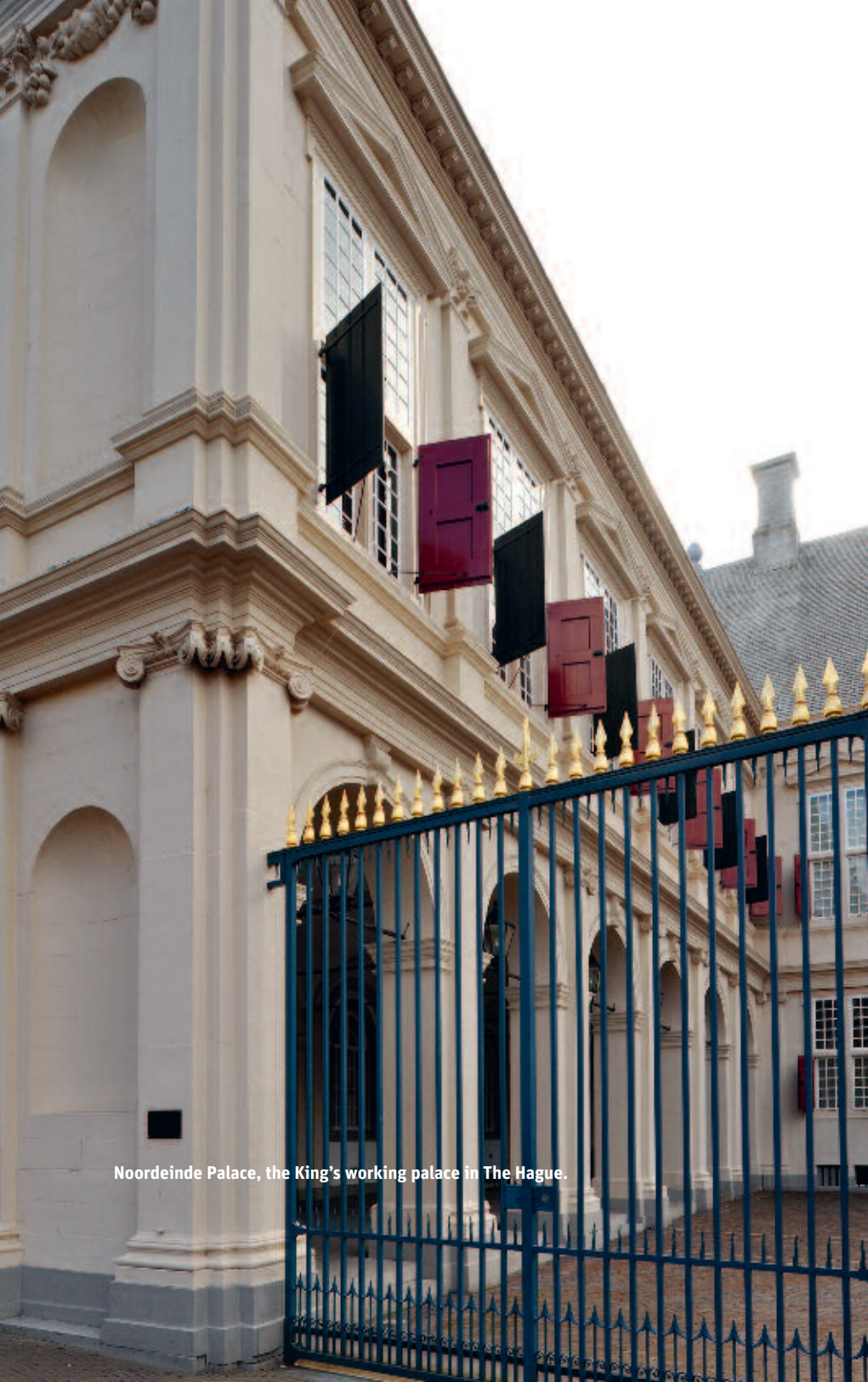
Noordeinde Palace, the King's working palace in The Hague.