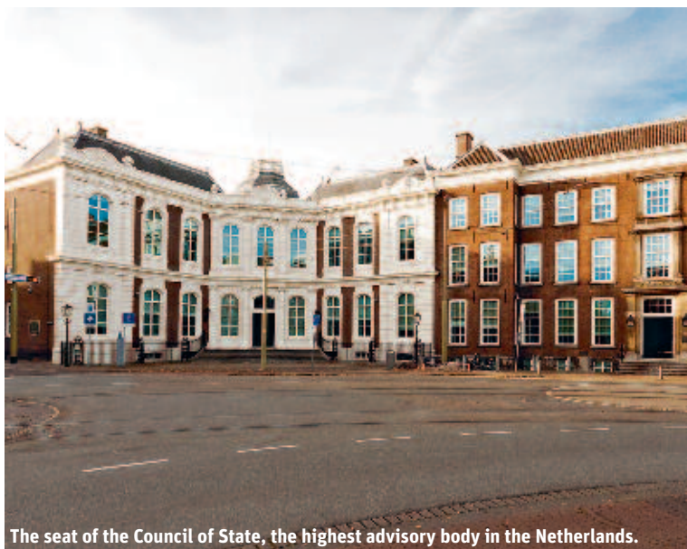
The seat of the Council of State, the highest advisory body in the Netherlands.

ministers of the departments that represent a significant share of the country's public spending. If these parties are unable to come to an agreement, the Council of Ministers will need to cut the proverbial knot. The new national budget needs to be finalised by the end of August, since it will be presented to the Dutch parliament on Prince's Day (the third Tuesday of September).