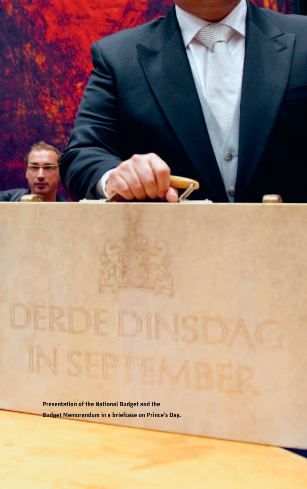
Presentation of the National Budget and the Budget Memorandum in a briefcase on Prince's Day.