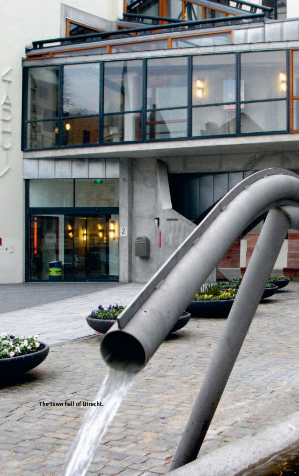
The town hall of Utrecht.