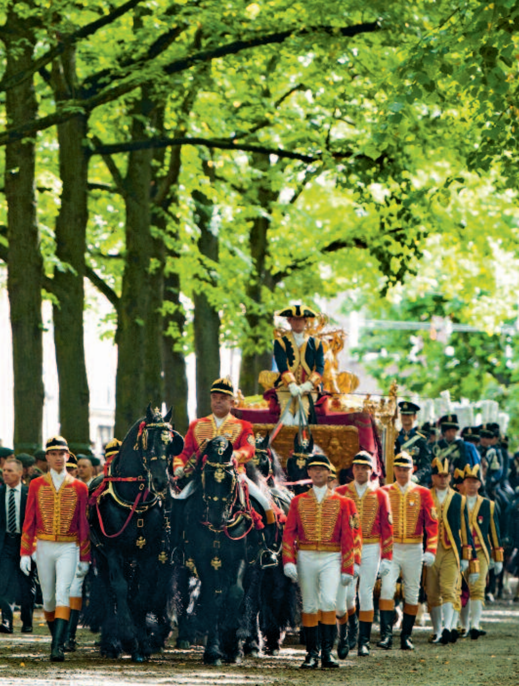
The head of state on the way to the Hall of Knights on Prince's Day.