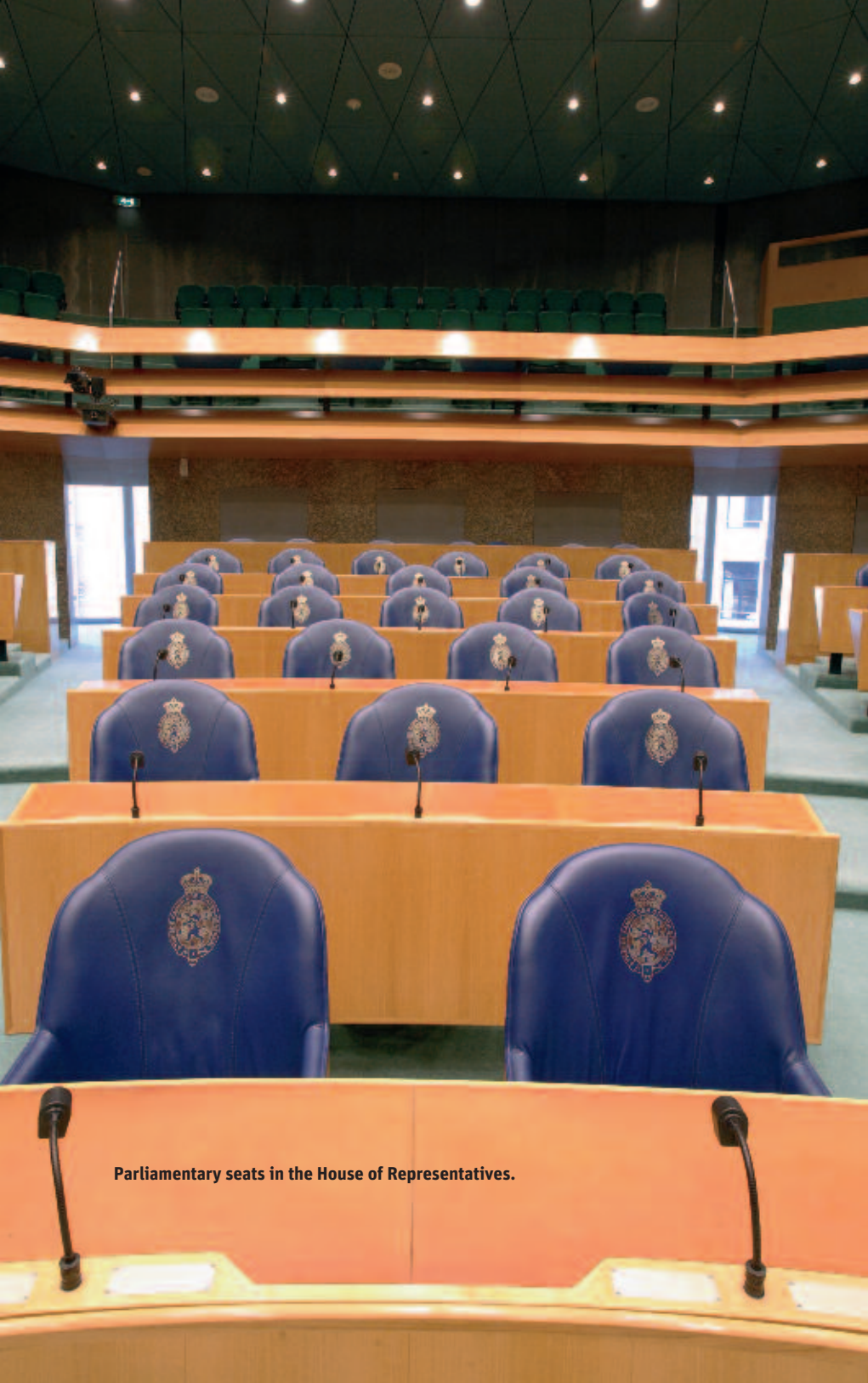
Parliamentary seats in the House of Representatives.