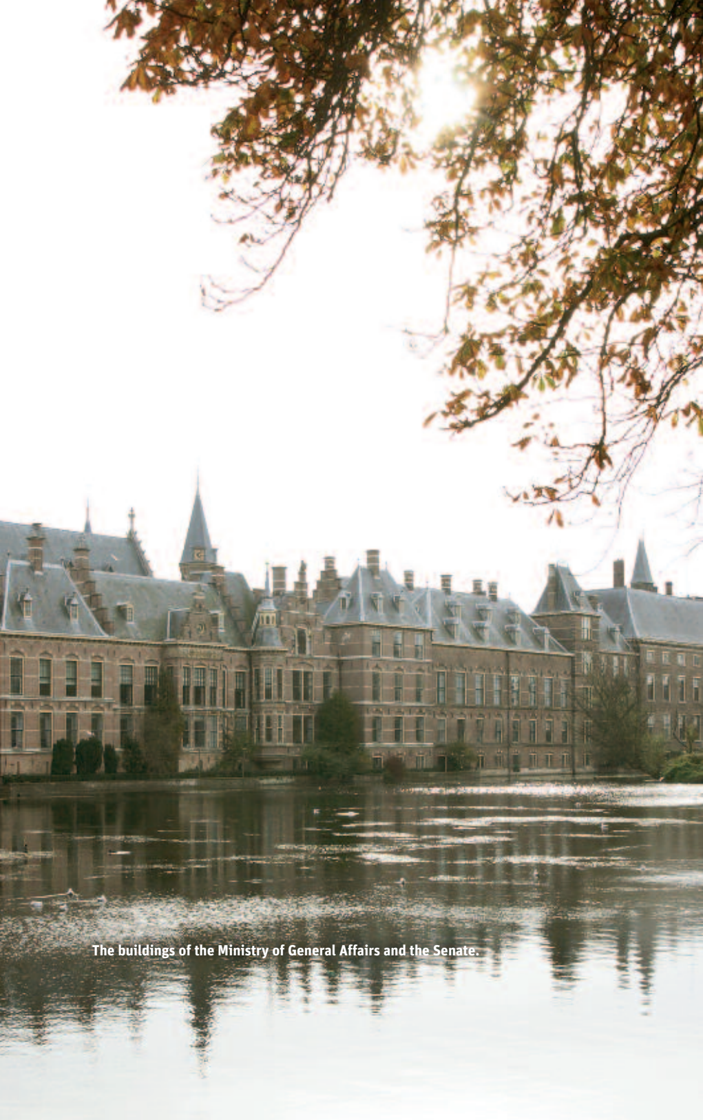
The buildings of the Ministry of General Affairs and the Senate.