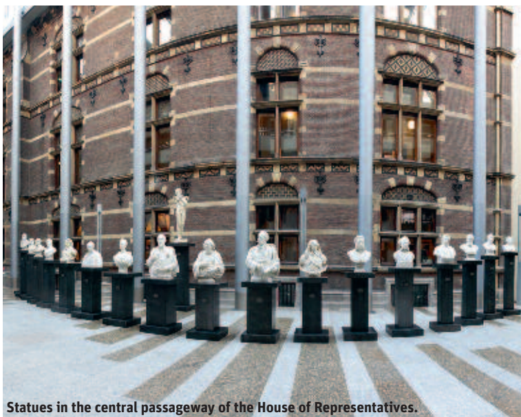
Statues in the central passageway of the House of Representatives.

Democratie or vvd). From the 1980s until the elections of 2006, the vvd formed the third-largest political faction in the Dutch parliament (with the exception of 2002). In the elections of 2010 and 2012, the vvd emerged as the largest party in the House of Representatives. The vvd aims to restrict the extent to which the state intervenes in the economic and social spheres and considers the individual freedom of all Dutch citizens of paramount importance. It expects citizens to accept personal responsibility for their circumstances.