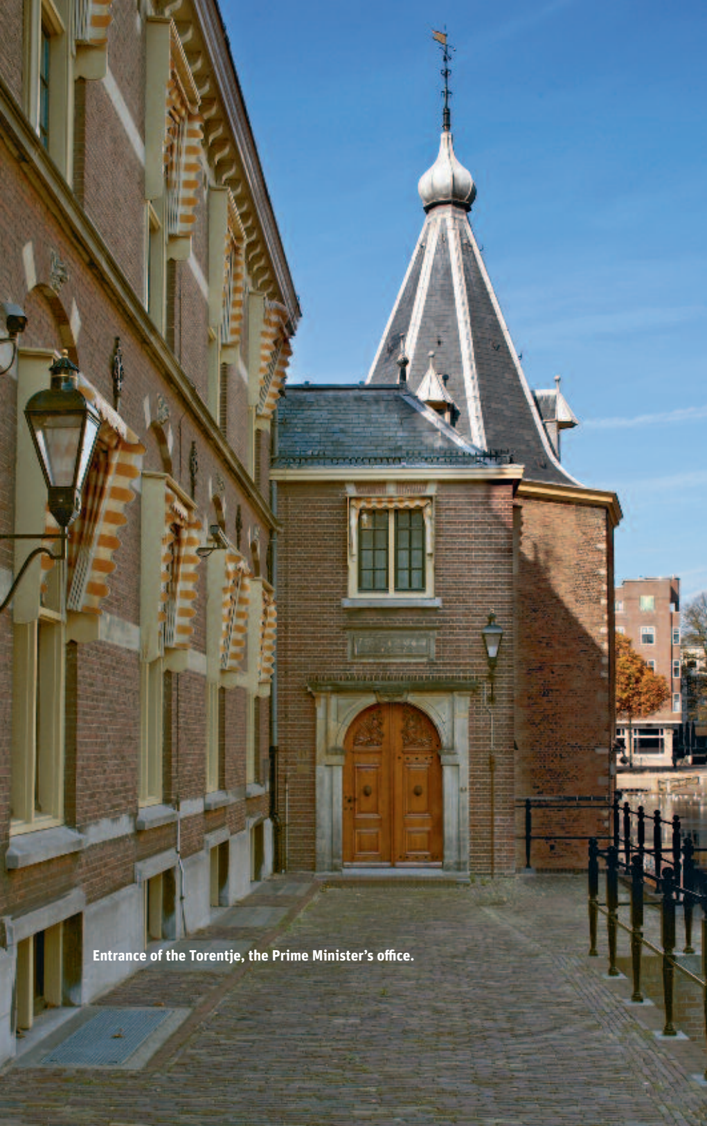
Entrance of the Torentje, the Prime Minister's office.