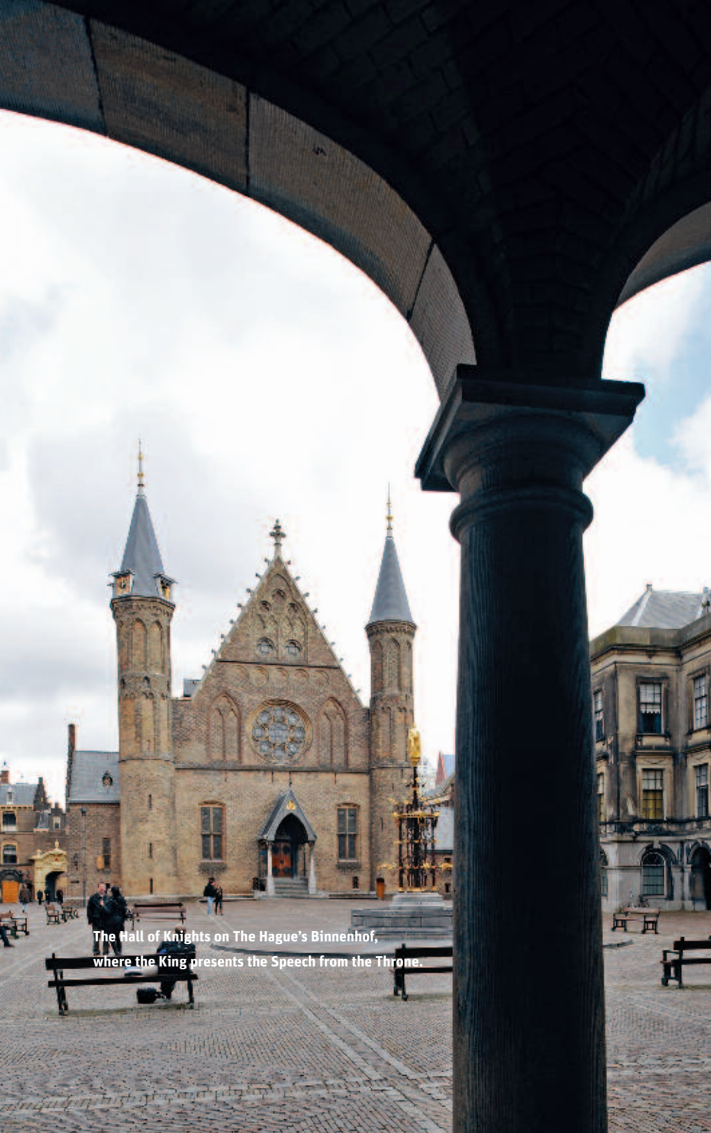
The Hall of Knights on The Hague's Binnenhof, where the King presents the Speech from the Throne.