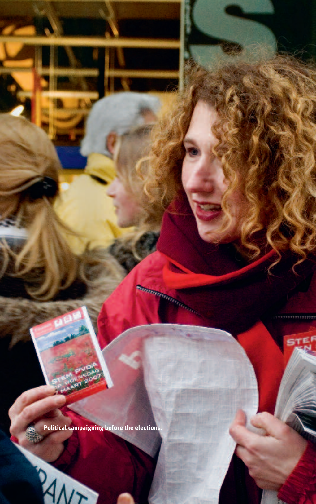
Political campaigning before the elections.