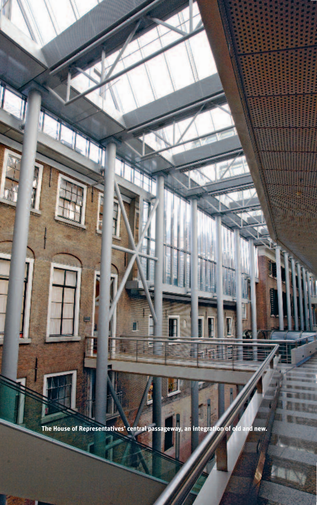
The House of Representatives' central passageway, an integration of old and new.