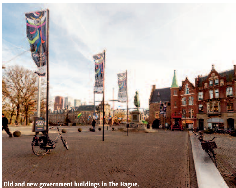
Old and new government buildings in The Hague.

dam as the nation's capital. After the departure of the French troops in 1813, Amsterdam remained the capital of the new Kingdom of the Netherlands, although, with the exception of the year 1814, it was not referred to as such in the Dutch Constitution. The city only acquired this status in 1983. But all this time, The Hague remained the official seat of the national government and the Dutch parliament. The 'working palace' of the Dutch monarch is also located in The Hague. However, the Constitution of the Netherlands stipulates that the swearing in and inauguration of the new Dutch monarch are to take place in Amsterdam, in the presence of all members of both chambers of parliament.