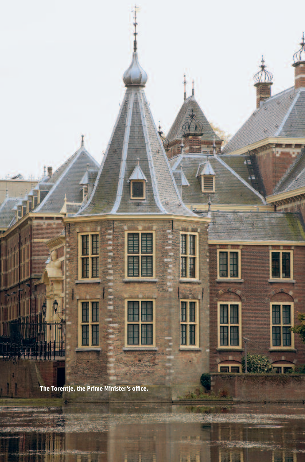
The Torentje, the Prime Minister's office.